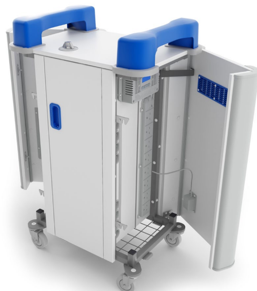
Side Doors Open