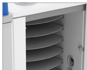
Fixed angled metal shelves