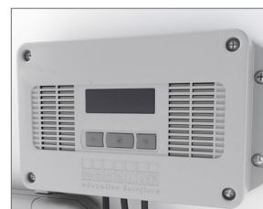
Power7 Energy Management System